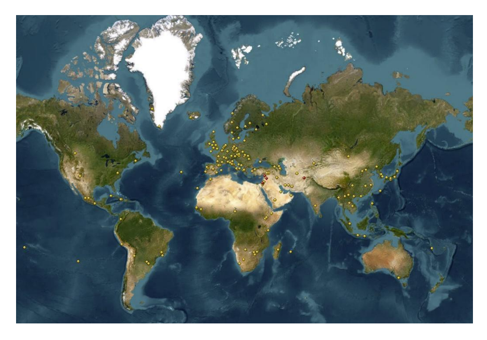
Fig. 1. World Heritage Map-cultural landscape

To fully understand the situation, it is essential to examine both the protection of cultural landscapes within China and the international context. Preserving these landscapes is vital for maintaining historical and cultural continuity and safeguarding the natural environments intertwined with them. This paper aims to enhance the understanding and protection of China's cultural landscapes by addressing three (3) key objectives: exploring the concepts and characteristics of cultural landscapes and cultural heritage, analysing the legal protection status of China's cultural landscapes while comparing typical protection measures in Asian and European countries, and identifying shortcomings in China's current protection efforts to propose actionable principles for future development. Through this comprehensive study, the research is expected to fill gaps in existing preservation strategies and provide a robust framework for ensuring that China's invaluable cultural landscapes are protected and appreciated for future generations.