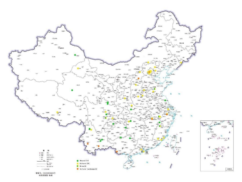
Fig. 2. Distribution of World Heritage sites in China