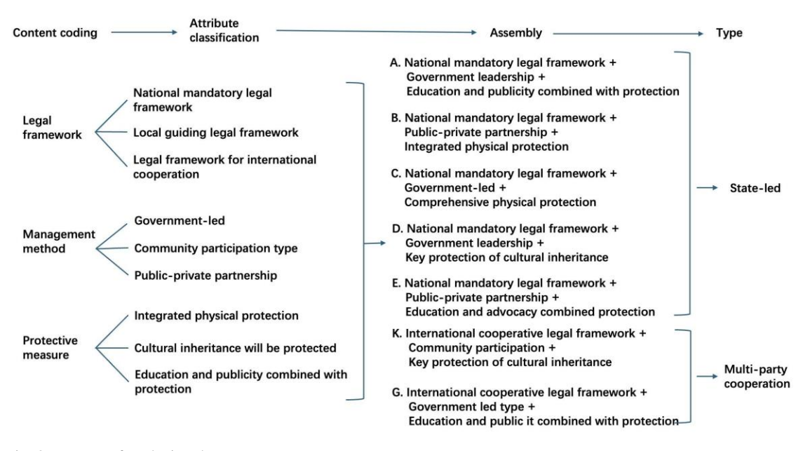
Fig. 3. Process of analysing data