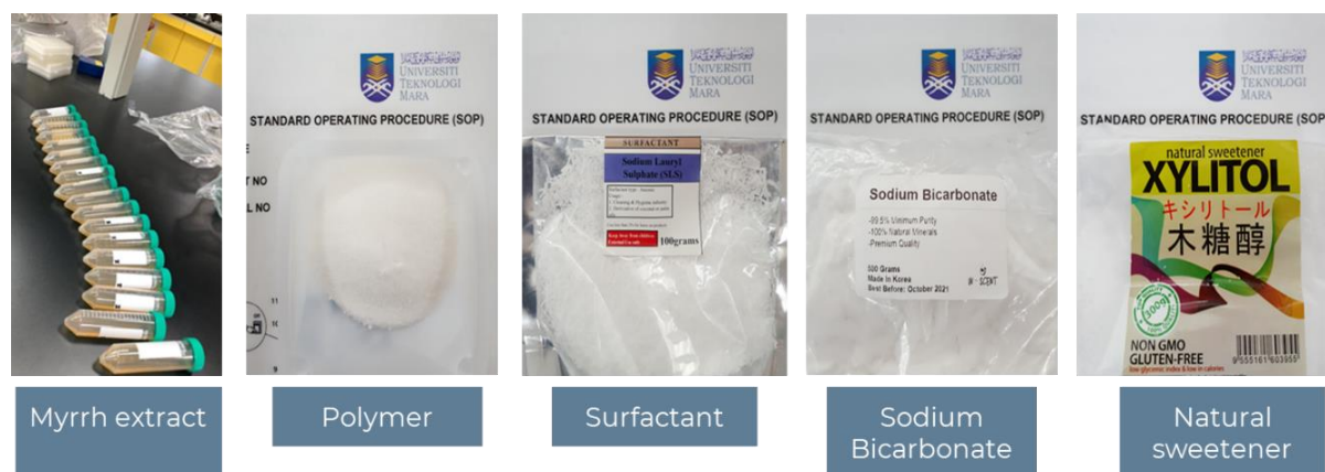
Figure 1: Myrrh toothpaste ingredients

Sixty-five grams of baking soda were poured into a bowl. Five tablespoons of xylitol were added into the bowl. Thirty-two 32 grams of HPMC were gradually added into the mixture. Two teaspoons of myrrh extract and a few drops of sodium lauryl sulphate were poured into the mixture. All the ingredients were mixed well until the desired texture was achieved.