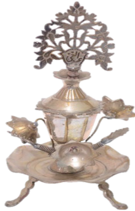
Figure 2. Celak from Malay World Ethnology Museum