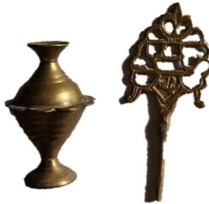
Figure 4. Celak from Personal collector