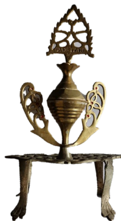
Figure 5. Celak from Personal collector