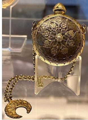
Figure 3. Celak from Islamic Arts Museum Malaysia