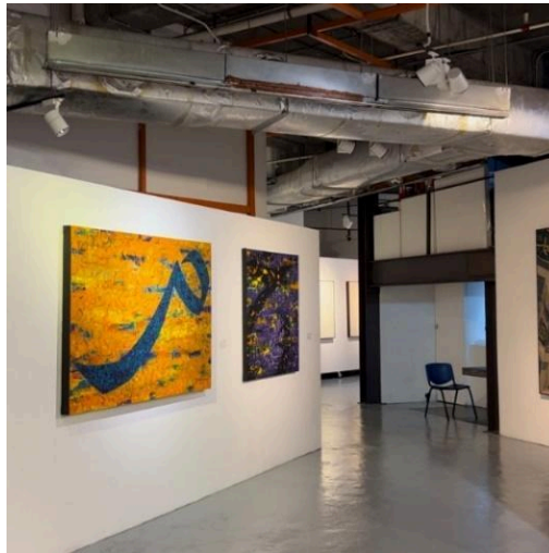
Figure 1. The interior view of Segaris Art Center