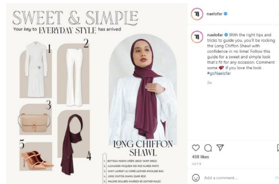
Figure 4. Creative Advertising Post by Naelofar Hijab Brand

Brand advertisements on Instagram Naelofar Hijab are evaluated using the AIDA model. This strategy is applied to the Naelofar Hijab Brand to examine ten successful campaigns utilizing an Instagram marketing tool to drive audience traffic to the brand effectively. The AIDA Model, which is hierarchical, explains how Instagram followers are directed toward making purchases related to the Brand's interest. The AIDA model, which is order-based, depicts how Instagram followers make purchases from a business. As a result, the process increases followers' contact with the Brand and elicits emotions, resulting in a more fulfilling and enjoyable brand experience. The experience may result in creating a new target audience based on feedback.