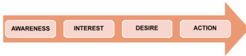
Figure 1. AIDA model