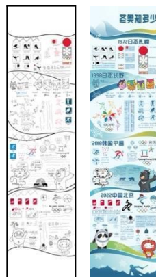
Figure 2. Prototype