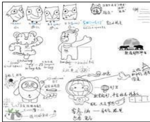
Figure 1. Brainstorming of the graphic elements and rough layout