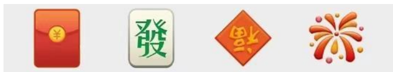
Figure 2. Emoji related to Chinese culture in WeChat

First is the diversity of cultural themes. Emojis generally represent traditional culture in relation to festivals due to system restrictions. For instance, the emojis in figure 2 depict red envelopes, prosperity, good fortune, and fireworks, all of which are customary Chinese New Year celebrations, from left to right. As opposed to this, sticker sets cover a wide range of traditional Chinese cultural themes. Popular ones include traditional festivals (such as the stickers in Figure 3 depicting the Lunar New Year theme and Figure 4 featuring Dragon Boat Festival themes), various types of cuisine (such as zongzi in Figure 4), traditional clothing (as seen in Figures 3 and 4 with cartoon characters wearing traditional Chinese attire), and so on. By providing users with a huge selection of symbols and phrases, this diversity showcases the depth and richness of Chinese culture.