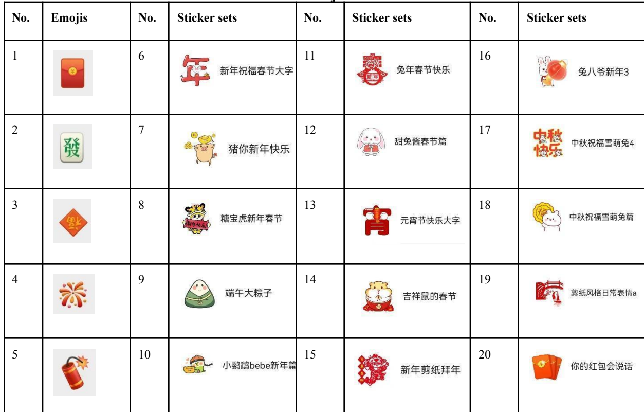
Table 2. 20 selected emojis and sets of stickers

Table 2 shows the selected 20 emojis and sticker sets. Via content analysis, these emojis and stickers featuring elements of traditional Chinese culture revealed four key findings.