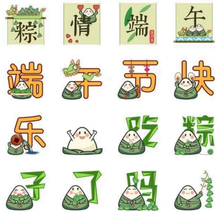
Figure 4. Emoji related to Chinese culture in WeChat

The second is the application of distinct symbolic patterns and meanings. The blending of traditional Chinese symbols and patterns into emoji and sticker designs is a standout example of how different symbolic meanings and patterns are used in these designs. These symbols, which include things like Chinese knots, gold ingots, and the auspicious colour red, are deeply ingrained in Chinese culture and each has a plethora of symbolic meanings. The emoji and sticker sets' deliberate integration of these symbols elevates them beyond simple representations of Chinese culture and transforms them into carriers of fortunate messages that ingrain cultural richness into their very being. This imbues them with a deeper layer of cultural significance, rendering them not just visually appealing but also profoundly meaningful and engaging for users. This provides them with a deeper cultural value, which renders them more relevant and compelling to consumers while also making them more visually appealing (Liu, 2018).