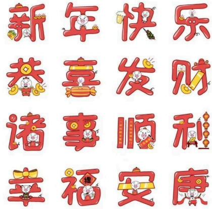
Figure 3. Chinese New Year Wishes Sticker sets