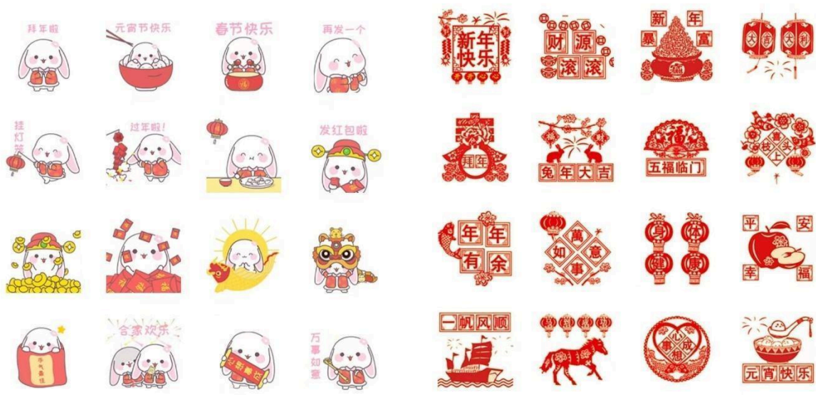
Figure 5. Rabbit Year Spring Festival Stickers in Different Styles

or a modern and humorous version. Emojis and stickers representing traditional Chinese cultural features are included into daily communication in a flexible and unrestricted manner to accommodate users' needs (Yang, 2021).