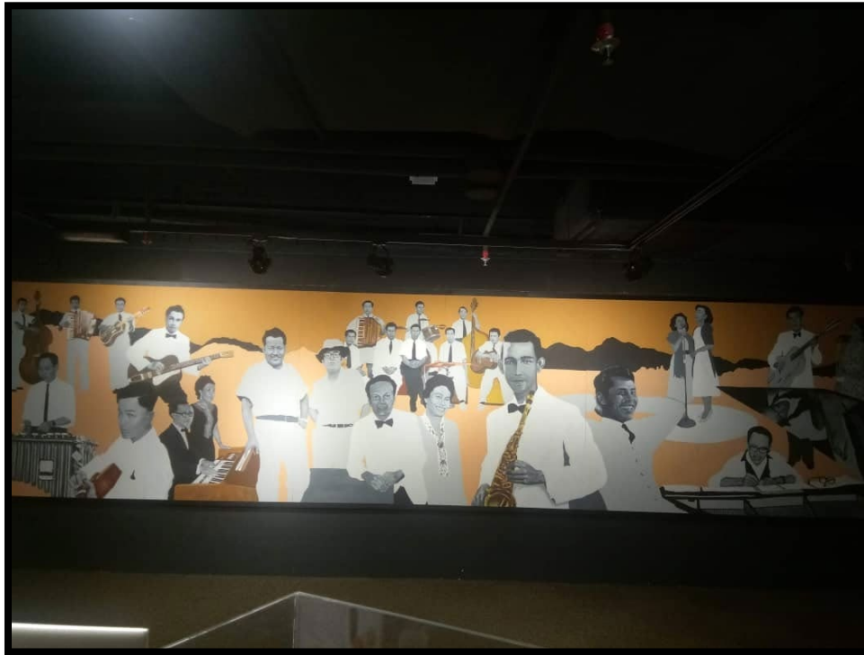
Plate 4: A Wall Mural at Penang House of Music

Nonetheless, except for Penang House of Music, the visitors are now able to feel it at their leisure hours such as entertaining the listeners with their antics or play any songs. Other than that, their voices while pretending to deejay can also be recorded in different languages with customizable musical backgrounds and the recorded audio will be sent to them via the messaging platform.