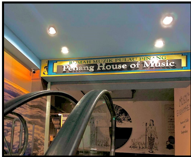
Plate 1: The main entrance of Penang House of Music

Penang House of Music has collected, housed, and is exhibiting a wide range of cultural practices that exist in Malaysia, particularly in the state of Penang and the music of local and worldwide communities that are rarely seen presently. This musical and cultural museum is one of the most interactive and exceptional museums in Penang with a fascinating array of the exhibition. This highlights that Penang House of Music has an astonishing interactive range of exhibits to display to its audience members and with no doubt, even the number of tourists who visit this museum is overwhelming.