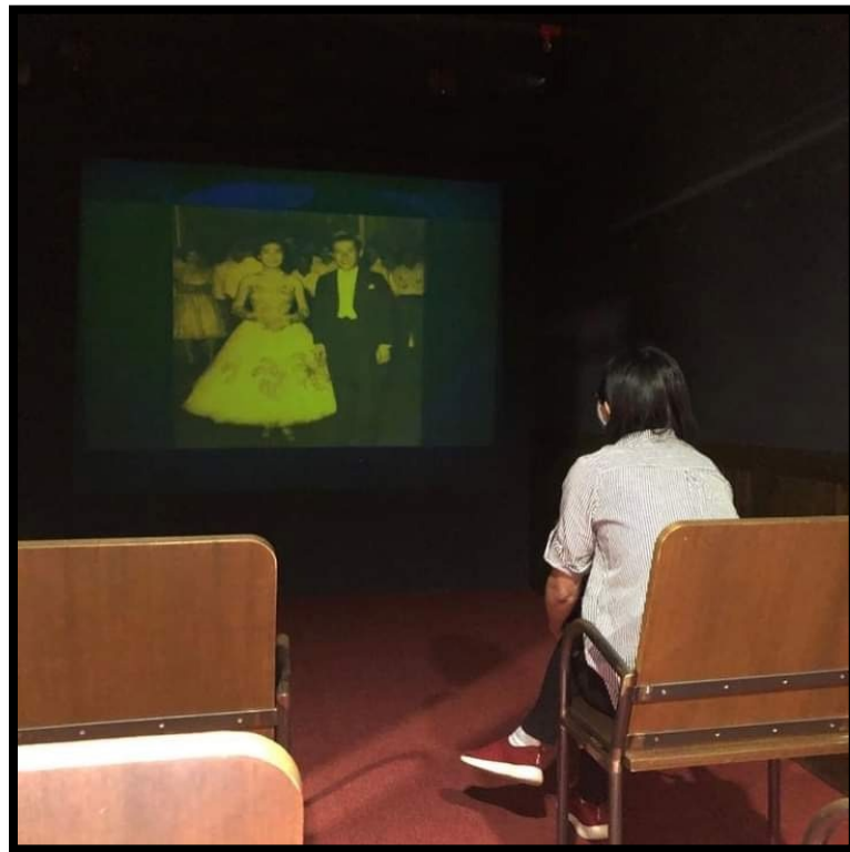
Plate 3: An interactive Cinema Room exhibition at Penang House of Music

In this musical museum, visitors typically go through all the exhibition sections presented at the Penang House of Music. In particular, visitors are also being assisted by experienced staff with very comprehensive information to illustrate each type of exhibition. This is because Penang House of Music is just 7000 sq. ft. With its relatively limited area, it allows visitors to explore the entire museum easier and quicker. Based on emphasis, the visitor at Penang House of music comes from diverse levels of ages and backgrounds. They also received a visitor as young as four years old.