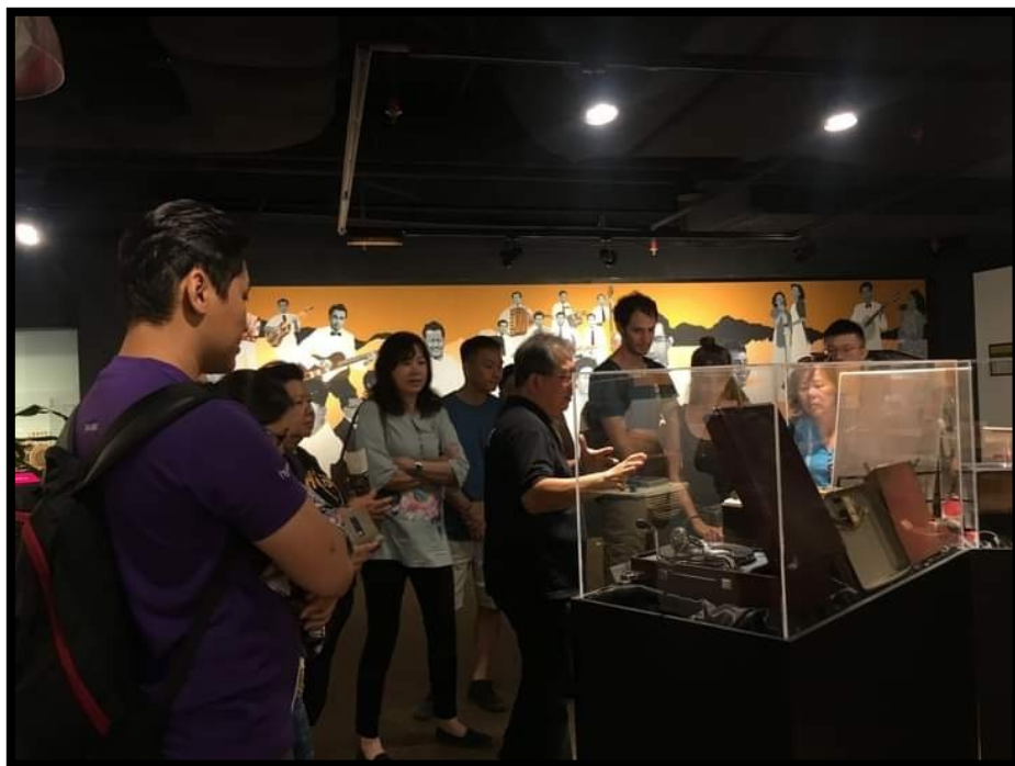
Plate 4: Visitors at the Penang House of Music attentively listening to the explanation by the curator.

In the Virtual Reality Area, Cinema Room, and Radio Room, where these exhibits are among the core attractions present in this museum, the visitors had shown faces of enjoyment, thrill, and amazement to experience each exhibition hall. In a broader term, visitors at Penang House of Music will visit on a massive scale on major holidays, school holidays, and local travel companies that include this museum as one of the places to visit in Penang in their calendars.