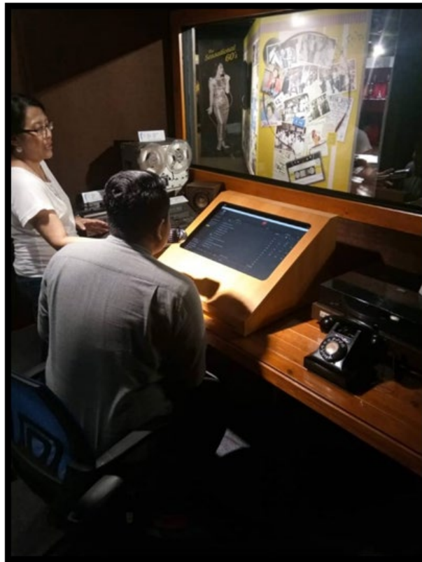
Plate 3: Visitors in the Radio Room at Penang House of Music

This musical theme museum at the Penang House of Music has several fascinating interactive collections featuring technological advancement where such collections are not accessible in other state museums in Malaysia. In this phenomenal museum, the interactive exhibition is divided into several main sections, namely musical instruments, cultural instruments, and seminars. Hence, Virtual Reality and Augmented reality are one of the interactive exhibits in the Penang House of Music which is very appealing to visitors. In any museum in Penang or Malaysia, this implemented feature is very hard to obtain because it requires a high level of expertise to manage it as well as massive expenses.