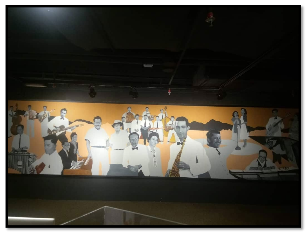
Plate 4: A Wall Mural at Penang House of Music

Nonetheless, except for Penang House of Music, the visitors are now able to feel it at their leisure hours such as entertaining the listeners with their antics or play any songs. Other than that, their voices while pretending to deejay can also be recorded in different languages with customizable musical backgrounds and the recorded audio will be sent to them via the messaging platform.