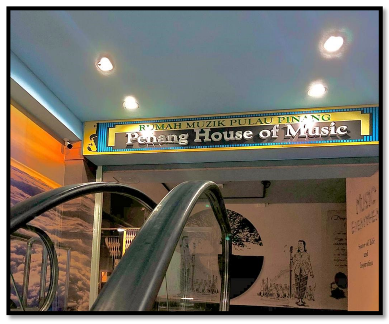
Plate 1: The main entrance of Penang House of Music

Penang House of Music has collected, housed, and is exhibiting a wide range of cultural practices that exist in Malaysia, particularly in the state of Penang and the music of local and worldwide communities that are rarely seen presently. This musical and cultural museum is one of the most interactive and exceptional museums in Penang with a fascinating array of the exhibition. This highlights that Penang House of Music has an astonishing interactive range of exhibits to display to its audience members and with no doubt, even the number of tourists who visit this museum is overwhelming.