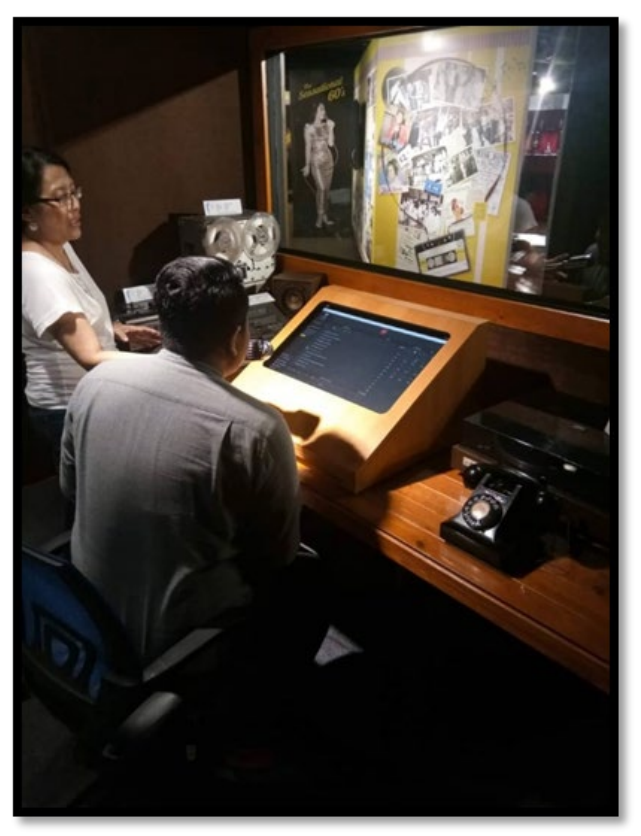
Plate 3: Visitors in the Radio Room at Penang House of Music

This musical theme museum at the Penang House of Music has several fascinating interactive collections featuring technological advancement where such collections are not accessible in other state museums in Malaysia. In this phenomenal museum, the interactive exhibition is divided into several main sections, namely musical instruments, cultural instruments, and seminars. Hence, Virtual Reality and Augmented reality are one of the interactive exhibits in the Penang House of Music which is very appealing to visitors. In any museum in Penang or Malaysia, this implemented feature is very hard to obtain because it requires a high level of expertise to manage it as well as massive expenses.