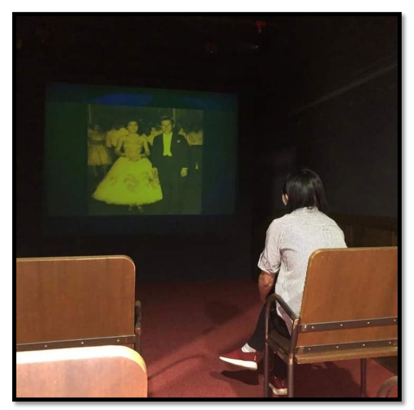
Plate 3: An interactive Cinema Room exhibition at Penang House of Music

In this musical museum, visitors typically go through all the exhibition sections presented at the Penang House of Music. In particular, visitors are also being assisted by experienced staff with very comprehensive information to illustrate each type of exhibition. This is because Penang House of Music is just 7000 sq. ft. With its relatively limited area, it allows visitors to explore the entire museum easier and quicker. Based on emphasis, the visitor at Penang House of music comes from diverse levels of ages and backgrounds. They also received a visitor as young as four years old.