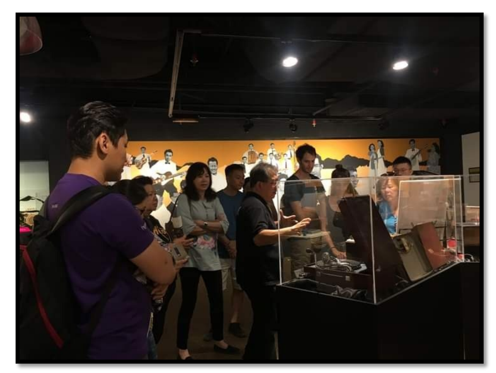
Plate 4: Visitors at the Penang House of Music attentively listening to the explanation by the curator.

In the Virtual Reality Area, Cinema Room, and Radio Room, where these exhibits are among the core attractions present in this museum, the visitors had shown faces of enjoyment, thrill, and amazement to experience each exhibition hall. In a broader term, visitors at Penang House of Music will visit on a massive scale on major holidays, school holidays, and local travel companies that include this museum as one of the places to visit in Penang in their calendars.