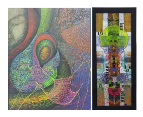
Figure 5 The Recent Project, the series of 'Spiritual Identity: The Overlay of Memories (Endless) No. 9 - 10', 2019, various sizes, mixed media (left to right)