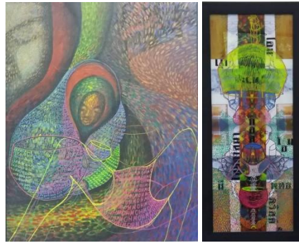
Figure 5 The Recent Project, the series of ‘Spiritual Identity: The Overlay of Memories (Endless) No. 9 - 10’, 2019, various sizes, mixed media (left to right)