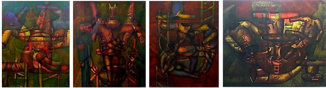
Figure 2 The Doctoral Project, the series of ‘Spiritual Identity: The Overlay of Memories No. 1 - 4’, 2009 - 2012, 150 x 180 cm, acrylic and ballpoint pen on canvas (left to right)