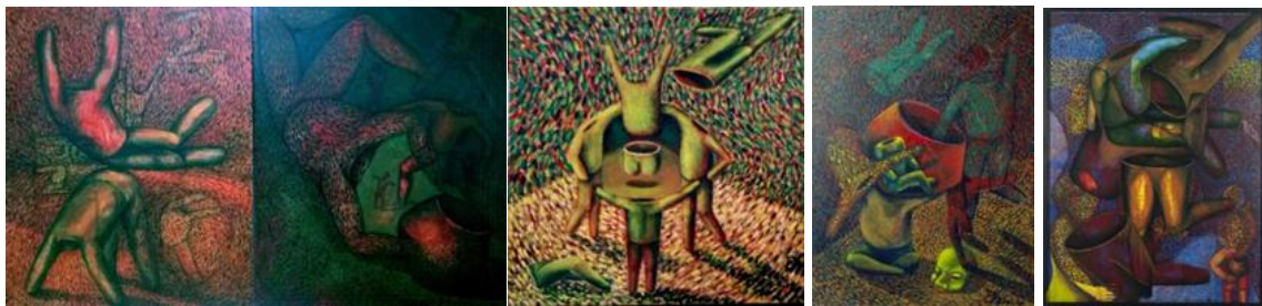
Figure 3 The Post-Doctoral Project, the series of ‘Spiritual Identity: The Overlay of Memories No. 5 - 8’, 2013 - 2017, various sizes, acrylic and ballpoint pen on canvas (left to right)