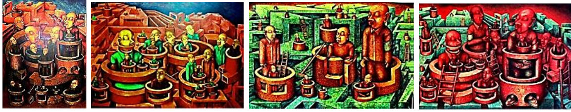
Figure 1 The Pre-Doctoral Project, the series of ‘Faith and belief: Assembly of Love No. 1- 4’, 2007 - 2008, 150 x 180 cm, 162 x 245 cm, acrylic and ballpoint pen on canvas (left to right)