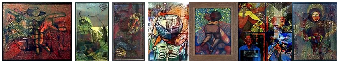
Figure 4 The Recent Project, the series of ‘Spiritual Identity: The Overlay of Memories (Endless) No. 1 - 8’, 2017 - 2018, various sizes, mixed media (left to right)