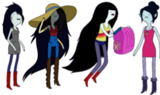
Figure 2 Marceline selected costumes; "Go With Me," "What Was Missing," "Sky Witch," and "Broke His Crown."