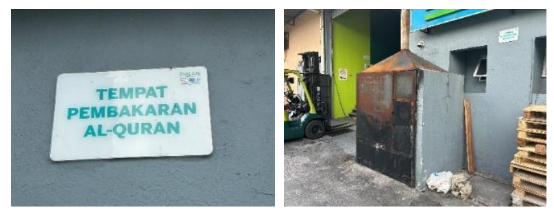
Figure 3. Al-Quran disposal site in My Qalam Printing (M) Sdn Bhd

Every printing facility must have a disposal area accessible only to authorised personnel. The size of the chamber depends on the factory's waste management. An appropriate disposal chamber is needed to accommodate the waste that is to be disposed of so that no waste is wasted because the existing chamber is too small or unable to accommodate the existing quantity.