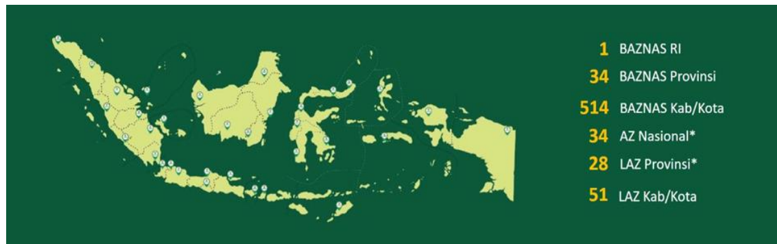
Figure 3. Distribution map of zakat institutions in Indonesia

Although there is an improvement in zakat decentralization in Indonesia, regulation and governance requirements to be licensed as official zakat institutions are still the main problem in this area. As stated in the National Law of Zakat (Law No.23/2011) and government regulation (Peraturan Pemerintah/PP No. 14/2014) on the detailed implementation of Law No. 23/2011, every single zakat institution must obtain a legal permit from Ministry of Religious Affairs before collecting and distributing the zakat funds. Previous to obtaining this legal permit, the institution must obtain a recommendation letter from BAZNAS Republic of Indonesia as it is mandated through PP No.14/2014. Given those extensive requirements, it is possible for zakat institutions to not follow those phases properly due to a lack of socialization for this administrative procedure.