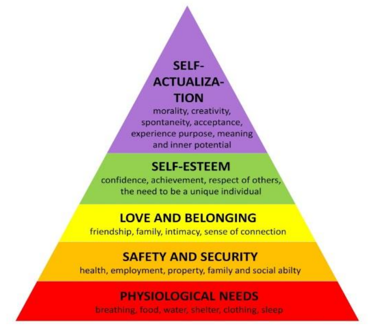
Figure 2. Maslow's Hierarchy of Needs