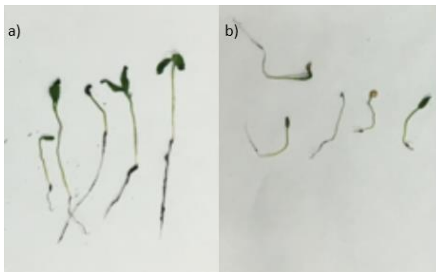
Figure 3: Growth performance of chili seeds imbibed in 6% GA 3 after seven days sowed (a) 1 hour imbibition period (b) 24 hours imbibition period.

According to Riley 1987, GA 3 have significant effect at very low concentration which can boost germination process, however too high concentration level may suppress the germination process. In this study, optimization of GA 3 concentration for seed priming was done and discovered that 6% was the best concentration for seed growth after 24 hours imbibition period (Figure 2). Then, the growth performance for 24 hours imbibition was followed by control, 3% H 2 O 2 and 6% H 2 O 2 . Control treatment showed comparable growth performance with 3% and 6% H 2 O 2 as the water is a universal imbibition medium that is widely used as soaking medium. Figure 3 below illustrated the seed growth performances imbibed with 6% for one hour and 24 hours.