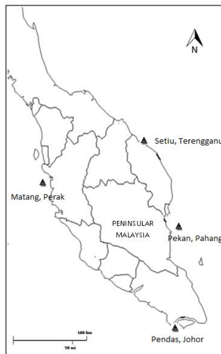
FIGURE 1. Map of Peninsular Malaysia showing mangrove area where larval fish were collected.

Identification of individual larval fish to the family level and if possible to genus level was carried out based on appropriate literature (Russell, 1976; Okiyama, 1988; Jayaseelan, 1998; Leis and Carson-Ewat, 2000; Ghaffar et al. , 2010). Morphological identifications were usually successful up to the family level and, for some individuals, up to the genus and species level. All individuals were measured to the nearest 0.1 mm total length, except for certain individuals lacking tailfins and tightly coiled or folded body shape. Voucher specimens were kept in the Aquatic Laboratory, Aquaculture Department, Faculty of Agriculture, Universiti Putra Malaysia, Serdang.